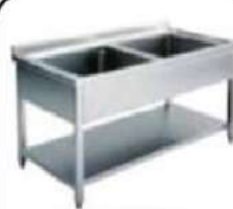
S/S DOUBLE BOWL SINK