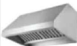
EXHAUST HOOD WITH FRONT SLOPE TYPE