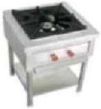
STOCK POT STOVE