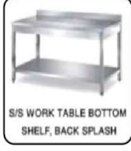
S/S WORK TABLE BOTTOM SHELF, BACK SPLASH