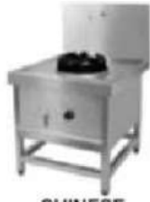
CHINESE COOKING RANGE