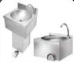
S/S KNEE OPERATED HAND WASH SINK