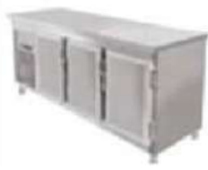
WORK TOP CHILLER