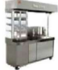
S/S TEA CART