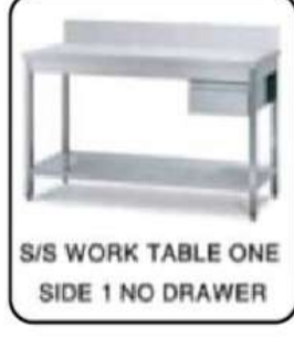
S/S WORK TABLE ONE SIDE 1 NO DRAWER