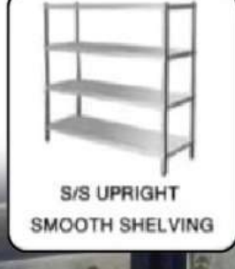
S/S UPRIGHT SMOOTH SHELVING