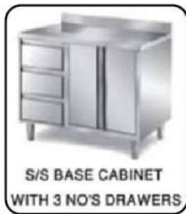
S/S BASE CABINET WITH 3 NO'S DRAWERS