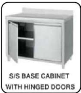
S/S BASE CABINET WITH HINGED DOORS