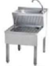
S/S MOP SINK