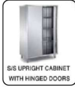
S/S UPRIGHT CABINET WITH HINGED DOORS