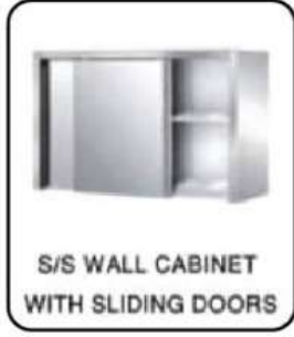
S/S WALL CABINET WITH SLIDING DOORS