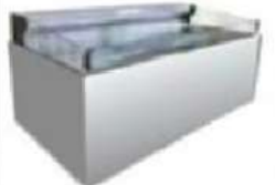
FISH DISPLAY COUNTER