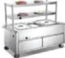
S/S BAINMARI OVER TWO TIER SHELF ONE HEATED SHELF