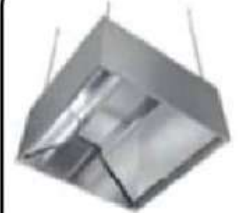
S/S CONDENSATE HOOD