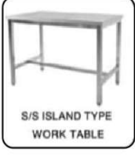
S/S ISLAND TYPE WORK TABLE