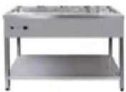
S/S BAINMARI WITH STAND