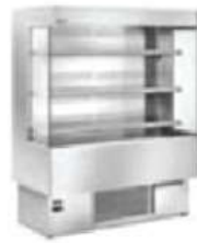
S/S GRAB & GO DISPLAY