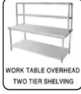
WORK TABLE OVERHEAD TWO TIER SHELVING