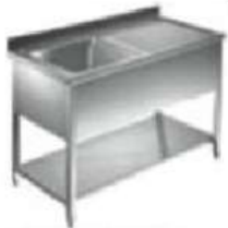
S/S SINGLE BOWL, SINGLE DRAIN BOARD SINK