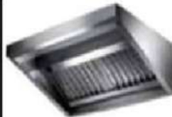
EXHAUST HOOD SHIP MODEL