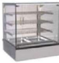
HOT DISPLAY CASE