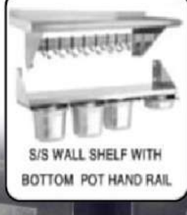
S/S WALL SHELF WITH BOTTOM POT HAND RAIL