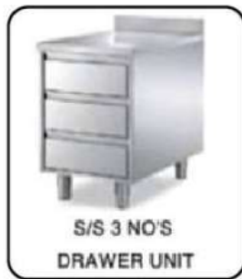
S/S 3 NO'S DRAWER UNIT