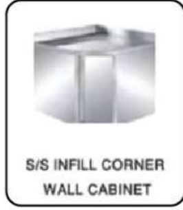
S/S INFILL CORNER WALL CABINET