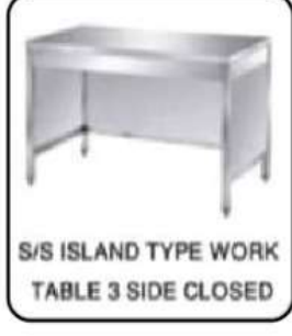
S/S ISLAND TYPE WORK TABLE 3 SIDE CLOSED