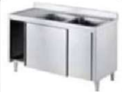
S/S DOUBLE BOWL, DRAIN BOARD WITH BOTTOM CABINET