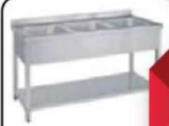
S/S TRIPLE BOWL SINK