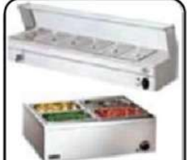
COUNTER TOP BAIMAIE