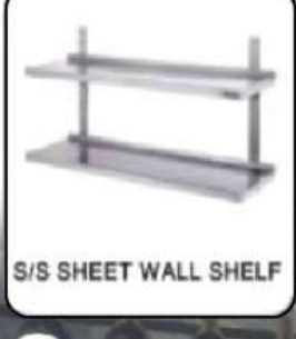
S/S SHEET WALL SHELF