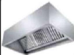
EXHAUST HOOD WITH FRESH AIR