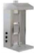
SHAWERMA SINGE TABLE TOP