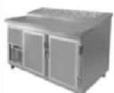
PIZZA PREP CHILLER