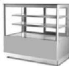
PASTRY DISPLAY CASE