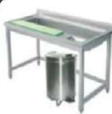
WITH CHOPPING BOARD