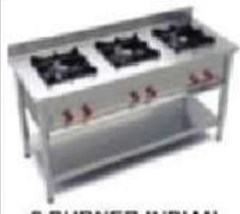
3 BURNER INDIAN COOKING RANGE