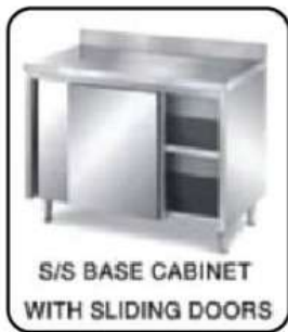
S/S BASE CABINET WITH SLIDING DOORS