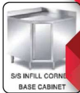
S/S INFILL CORNER BASE CABINET