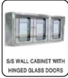
S/S WALL CABINET WITH HINGED GLASS DOORS