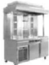
SHAWERMA MACHINE WITH BOTTOM CHILLER