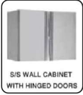
S/S WALL CABINET WITH HINGED DOORS