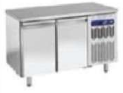
WORK TOP CHILLER