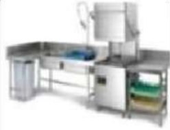
S/S DISH LANDING TABLE WITH OVER RACK SHELF