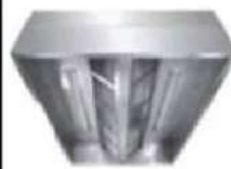
S/S ISLAND TYPE EXHAUST HOOD