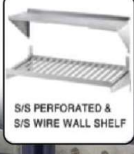
S/S PERFORATED & S/S WIRE WALL SHELF