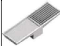
S. STEEL FLOOR GRATING