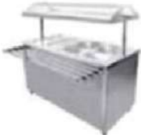
S/S BAINMARI FRONT TRAY RAIL, SNEEZE GUARD